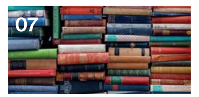
Use the right technical jargon and buzzwords to increase your impact in the decision-making process.