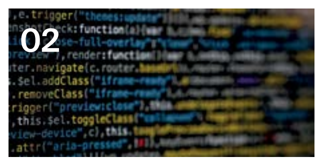
Feel comfortable discussing the technologies that have started disrupting the banking world in recent years.